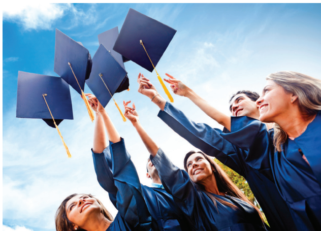
Thirteen $1,000 scholarships are available! Submit your application by March 2, 2015.