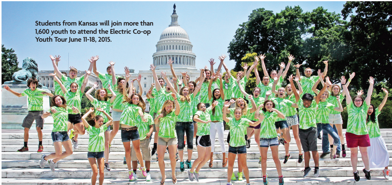
Students from Kansas will join more than 1,600 youth to attend the Electric Co-op Youth Tour June 11-18, 2015.

Win a Trip to Washington, D.C., or Steamboat Springs, CO