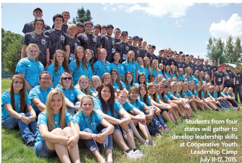
Students from four states will gather to develop leadership skills at Cooperative Youth Leadership Camp July 11-17, 2015.